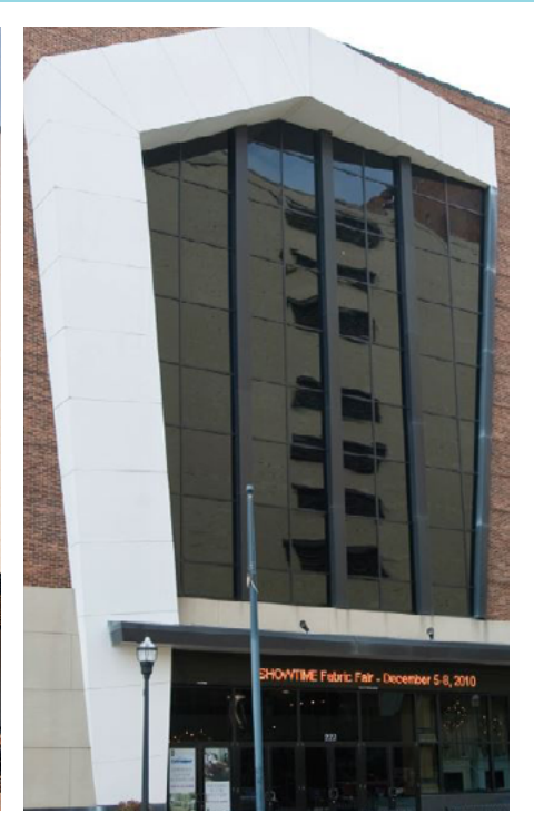
Plaza Suites Temporaries

Temporary exhibit space is a great place to start if you are a smaller, growing company, don't require as much space, or would like to leverage the walk-by traffic more common in temporary exhibit areas.